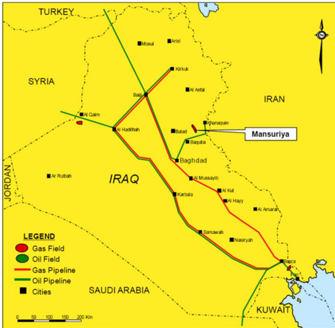
Figure 1.1 – Mansuriya Field Location

Turkish Petroleum Overseas Company (TPOC), Kuwait Energy Company (KEC) and Korean Gas Company (KOGAS) (Consortium) have signed an initial agreement with the Iraqi Oil Ministry for the Mansuriya Field Development Project. The development plan involves two phases; Phase 1 is to achieve 100 MMSCFD of dry gas production. Phase 2 involves an expansion of the production capacity to 320 MMSCFD by 2023.