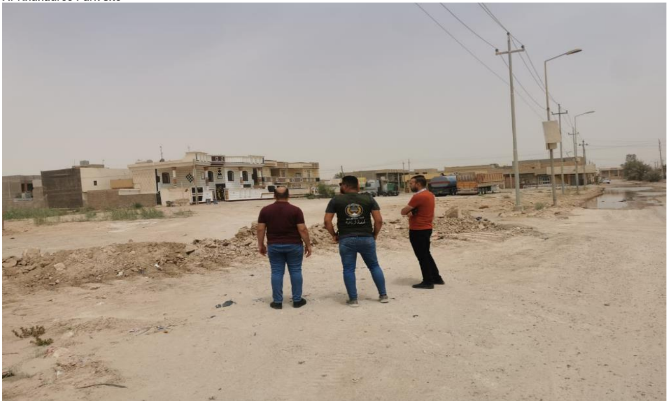
Kilo 6 Park site