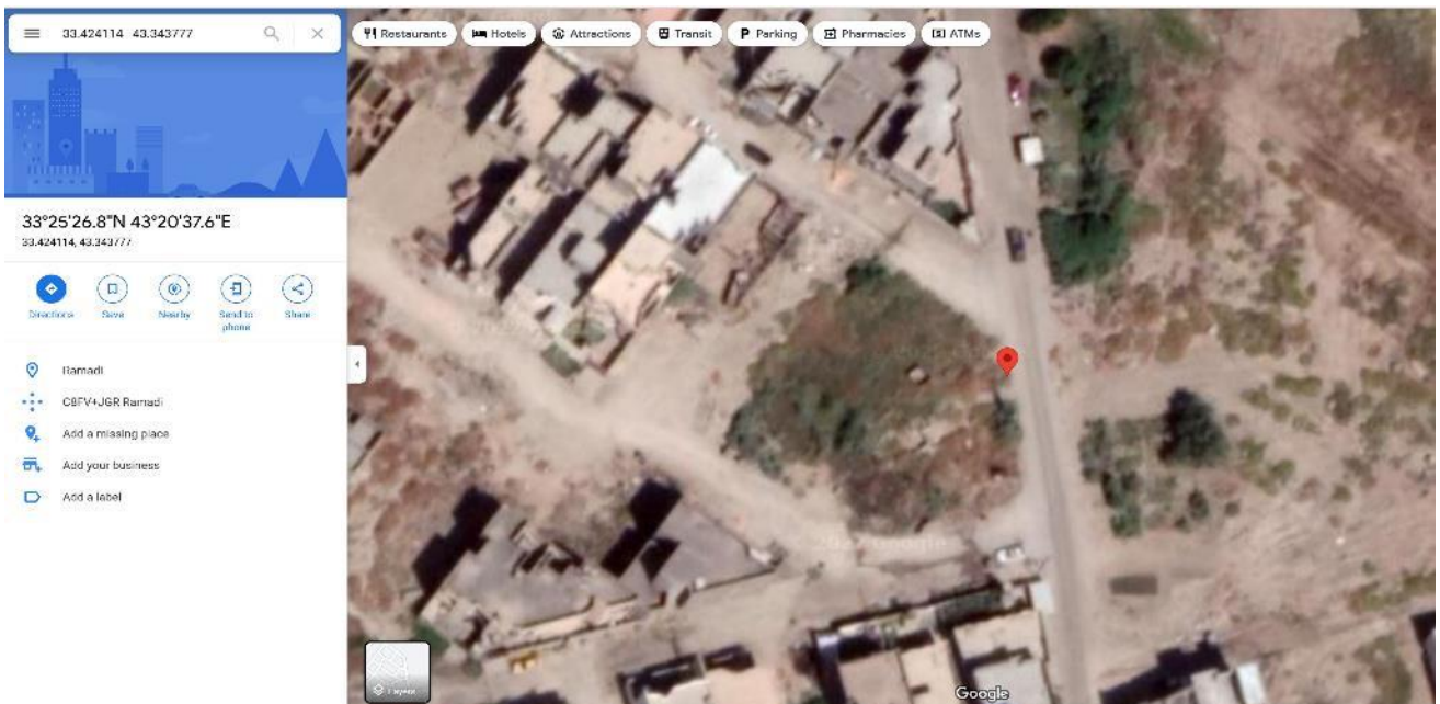
Al-Khadree Park site