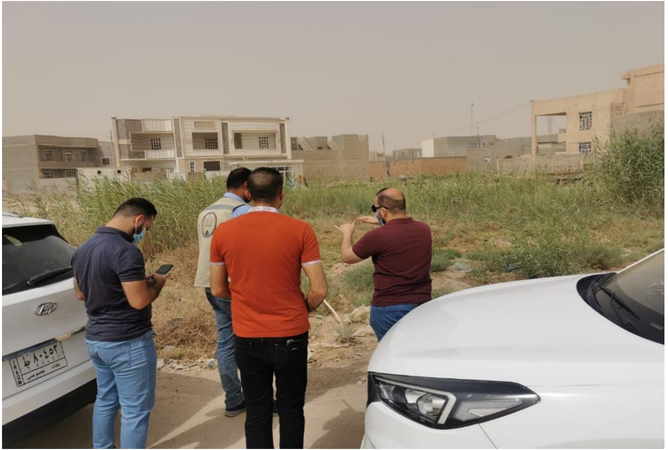
Al-Khahadree Park site