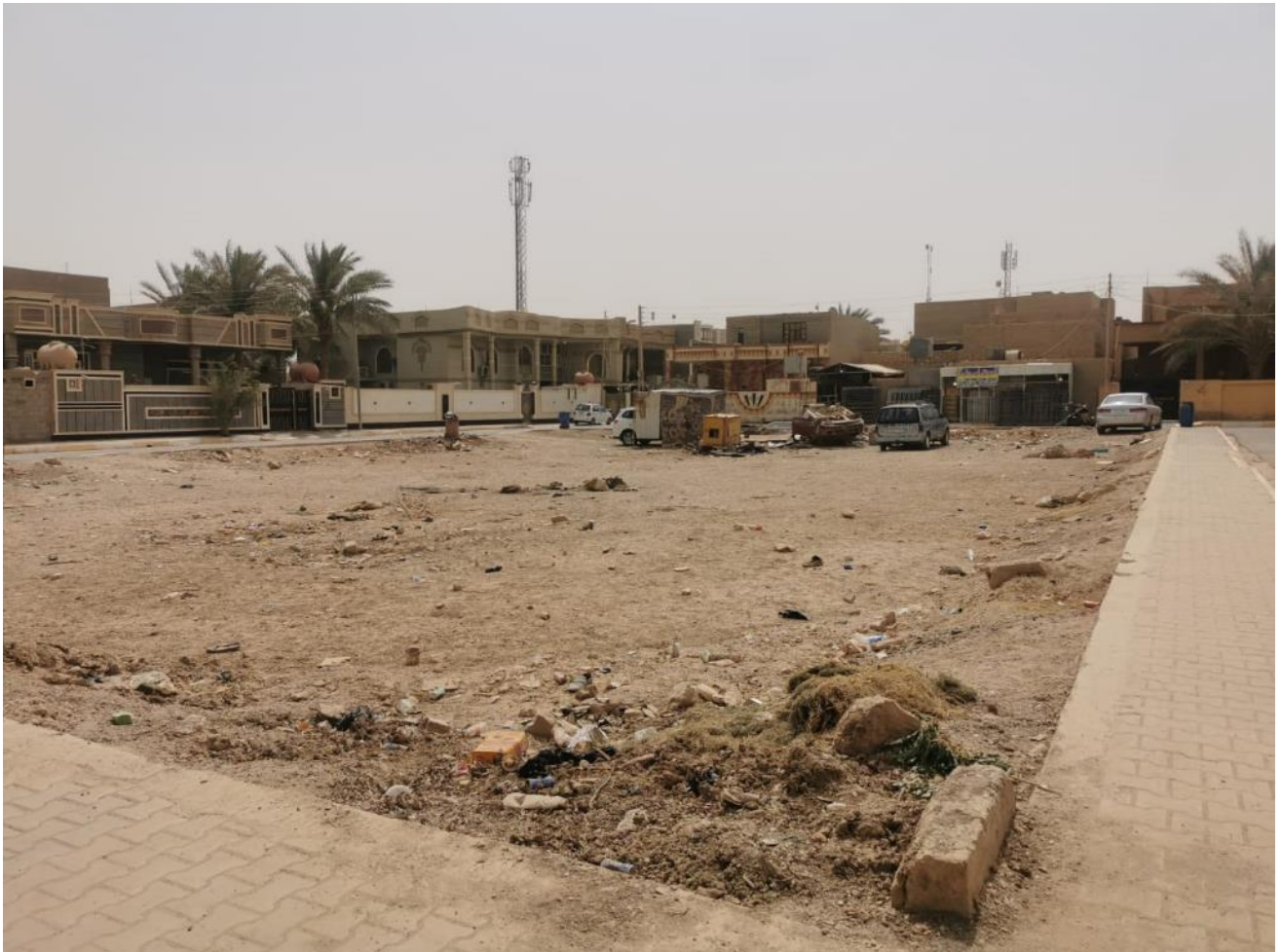
AI – Ta meen Park site