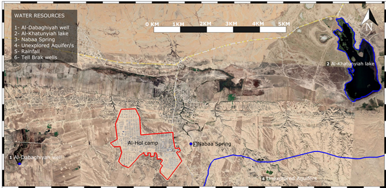
Figure 1 – Area of study, 36°23'36.04"N, 41° 9'30.59"E